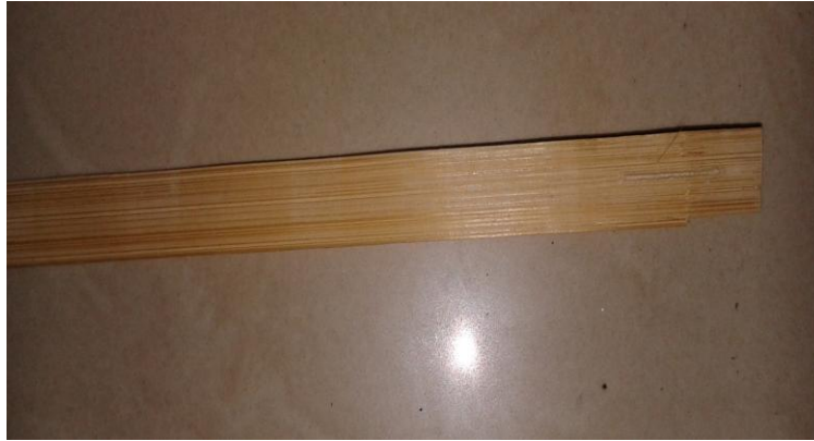
Fig 1. Bamboo Fiber

2.2 Matrix: Matrix is a material which holds the fibers together. It protects the fibers from environment and abrasion with each other. Matrix distributes the loads evenly between the fibers. It helps to maintain the distribution of fibers and provides better finish to final product. In the experiment epoxy resin is used as a matrix material. Modulus of elasticity of epoxy resin is 3700 MPa.