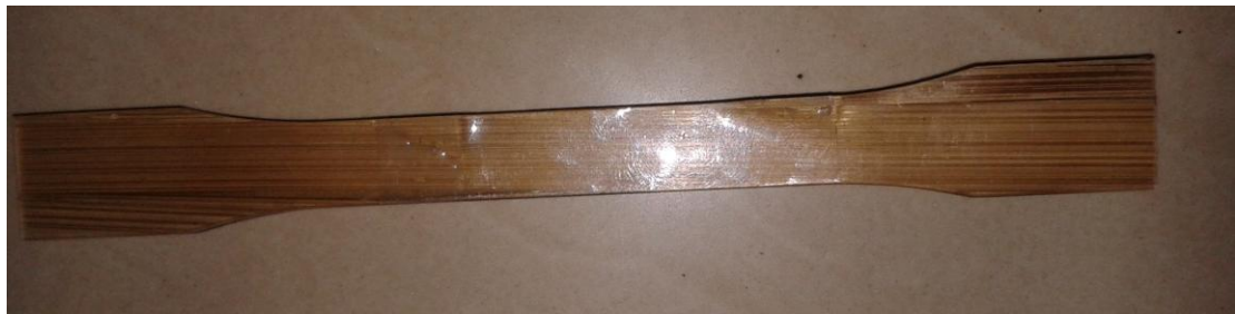
Fig 4. Test Specimen