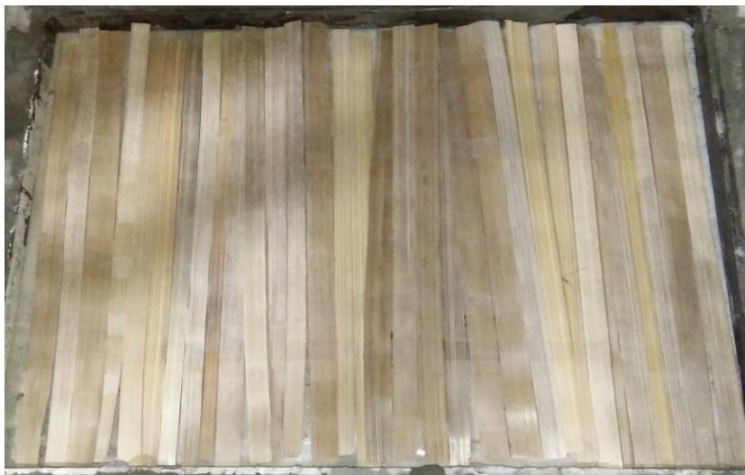
Fig 2. Composite Lamina

2.3 Preparation of Composite: Composite laminate was prepared by conventional hand lay-up method. The mould frame was made from steel angle sections having dimensions 350mm×330mm×20mm which was laid on top plastic sheet and artificial clay was used to seal the space between them to prevent leakage of resin material out of the mould. One layer of fiber strips was laid down in the mould and they were coated with epoxy resin mixed with hardener. On top of which, another layer of fiber strips were laid down and process was repeated until the required thickness of the composite was achieved. A dead weight of 10 Kg was placed on the prepared laminate so as to remove any porosity or air bubbles.